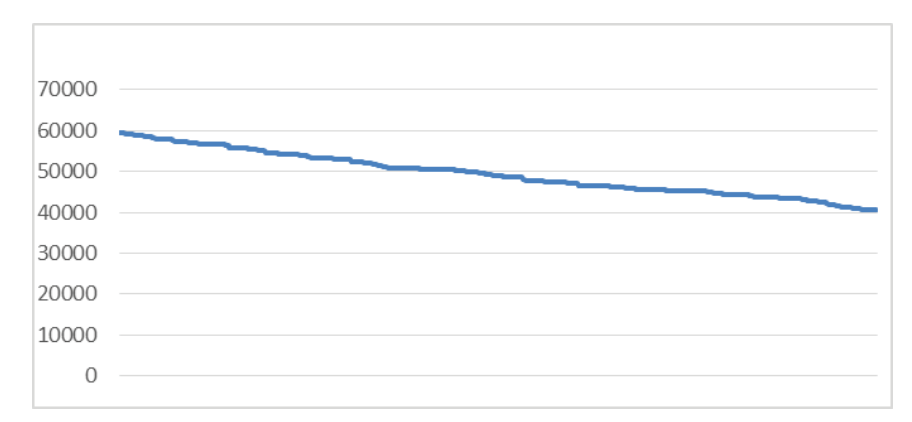
Fig. 3. Natural resource reserve for use / USD.