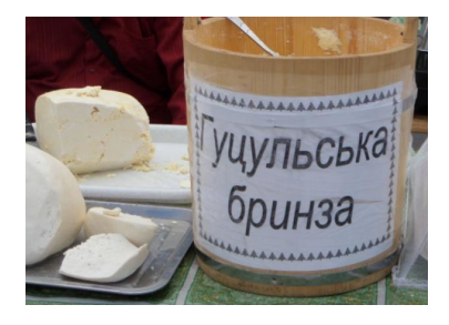
Picture 2 Monolingual inscription on goat cheese sold at a street fair on Berehove Town Day (May 2017)5

Picture 3 Bilingual inscription on goat cheese sold near a thermal water pool that is visited by tourists (August 2017)