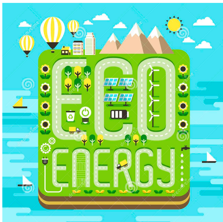
Fig. 2. Example of visualised summarisation of ecoenergy issues [10]

Consequently, an apparent task in public education is to integrate RES-related knowledge into elementary school curriculum and intensify this knowledge in secondary schools. The objectives set for the above can have a broad range including training for practicality and introduction of environmentally friendly and cost-effective technologies etc. However, it is important to note that graduating students should be aware of the essentials and main advantages of these innovations, by which a considerable contribution to the energy-conscious development of society can be made.